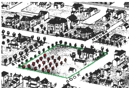
The Iles / Irwin block; 1872 map